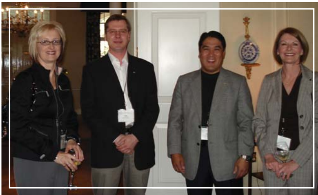
CMC Reception, CMC-Ontario-Southwestern Ontario Chapter